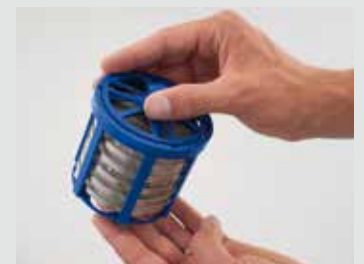
Removing cleaned and dried baskets