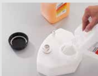
Filling cleaning and rinsing solution