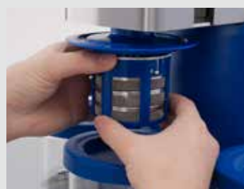
Inserting basket frame