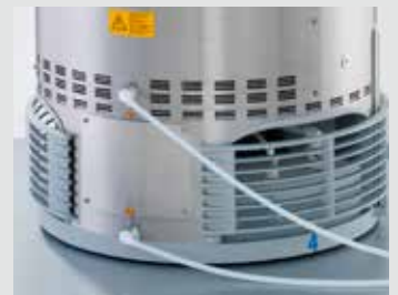
Controlled exhaust air routing