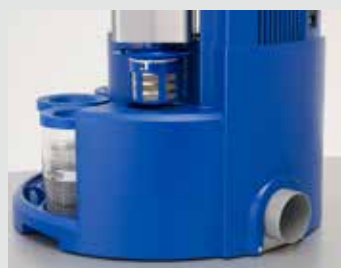
Connecting to exhaust air routing