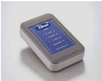
Elmasolvex® VA with wide range of accessories

The new standard for the use of flammable solvents in watch movement cleaning