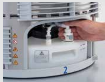
Connecting media containers