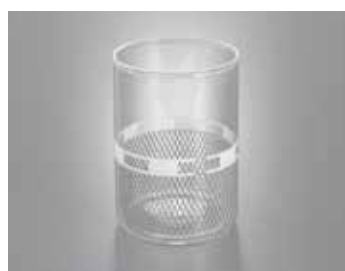
Elmasolvex® SE with wide range of accessories