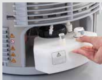
Installing media containers