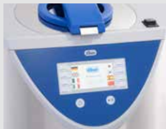
Selecting and starting program