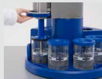
Raising, lowering and closing