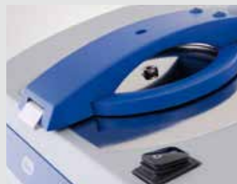
Vacuum is established