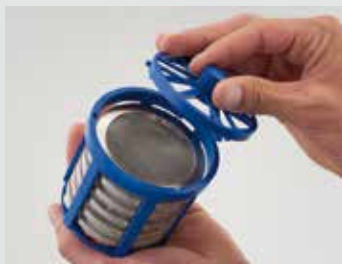
Filling baskets with watch parts

Elmasolvex VA has its own self-contained intrinsic Ex-protection due to the vacuum technology used and all the measures required by TÜV and the applicable technical regulations for explosion safety. This means that the explosion protection measures integrated in the machine already rule out any fire hazard in the primary zone, operation in compliance with the manual provided. The use of ultrasound is thus legally possible and permitted. The TÜV test performed confirms the requirements for the use of the prescribed CE mark.